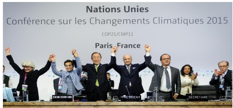
Closing Ceremony of UN Climate Change Conference, COP21 in Paris, 2015