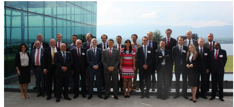
Participants, Geneva, 2017

Marten van den Berg, Director General for Foreign Economic Relations, Dutch Ministry of Foreign Affairs