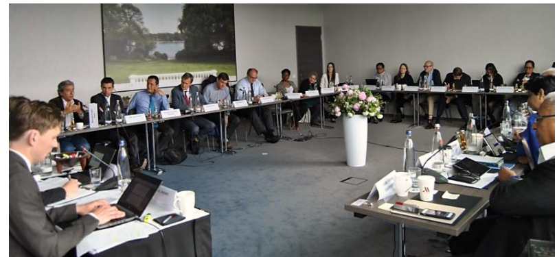
Workshop for Fiji, Bonn, 2017