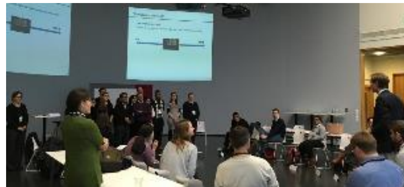
UNEP Training, Finland, 2016

Participant in UNEP Training on Multilateral Environmental Agreements